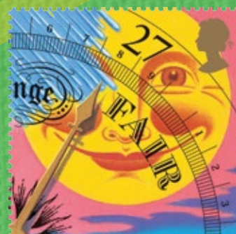
W is for weather