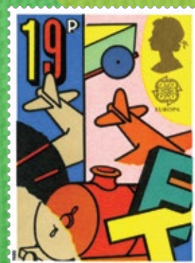
T is for toys