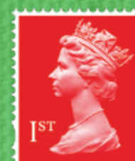
Q is for queen