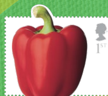
V is for vegetable