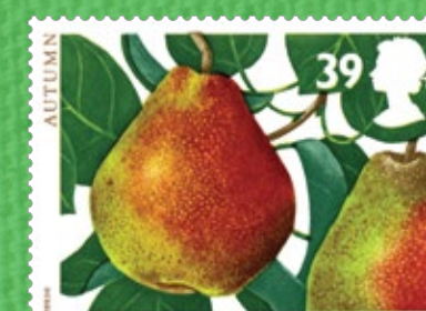
P is for plant