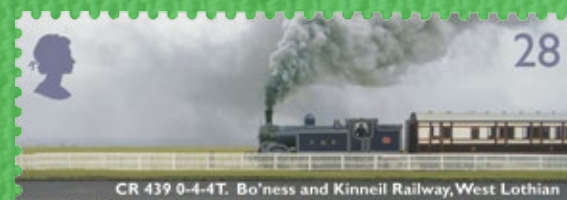
R is for railway