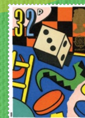
G is for game