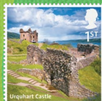
U is for Urquhart castle