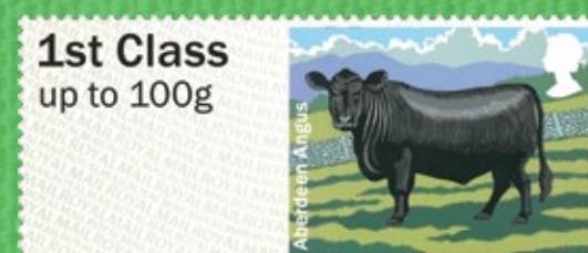
C is for cow