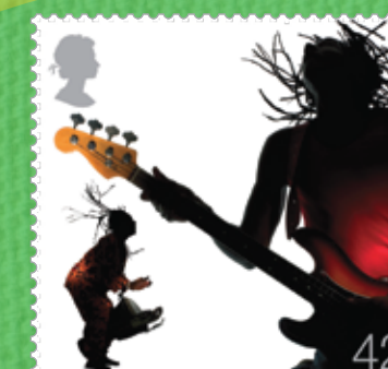
M is for music