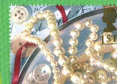
J is for jewellery