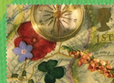
N is for navigation