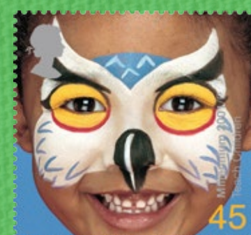
O is for owl-face