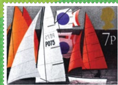
Y is for yacht