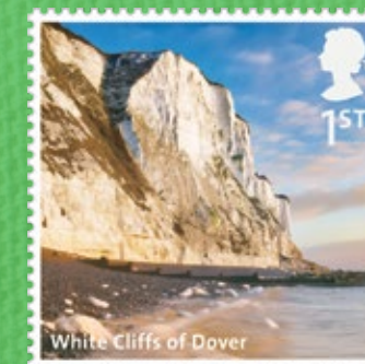
L is for landscape