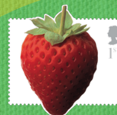
F is for fruit