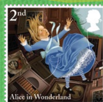
A is for Alice