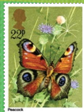
B is for butterfly