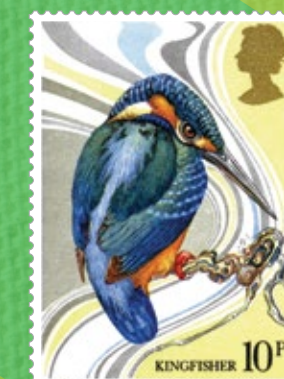
K is for kingfisher