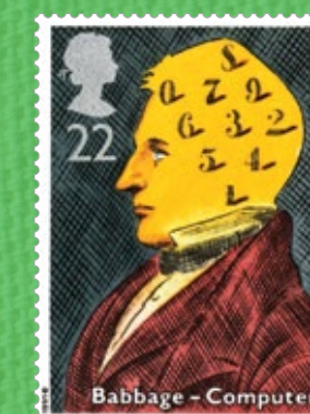
I is for inventor