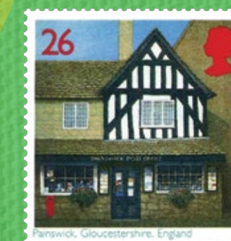
H is for house