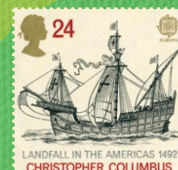
E is for explorer