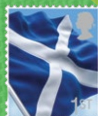
X is for 'X' on the Saltire Cross