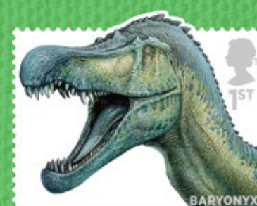
D is for dinosaur